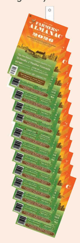
12-Copy Clip Strip Hang from existing end caps. Saves floor space.

Easy-hanging displays perfect for crossmerchandising throughout your store.