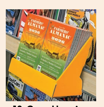
18-Copy Hanging Clip-On Display Clips right on your shelves. Universal size